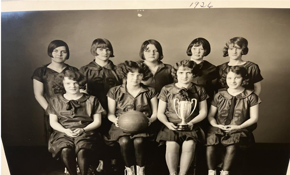
Howell High Women and Men's 1926 Championship Teams