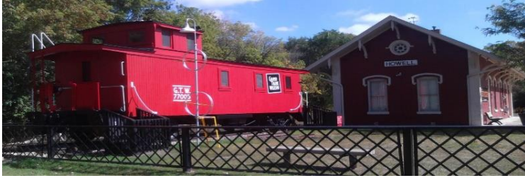
Depot Museum Complex

Howell Area Historical Society 128 Wetmore St. Howell, Michigan 48843