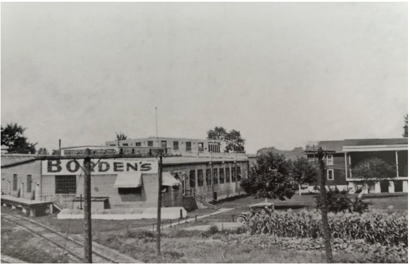
The property was eventually sold to Bruce Products in 1926.

Since the milk had to be delivered to Lansing for processing, it stood to reason that a milk condensing facility should be built in town. It opened in 1894, and, provided local employment. The factory added even more to Howell's reputation nationally, as a center for the sale and breeding of Holstein cattle. Unfortunately, after many years of success, the building was destroyed in a fire in 1913, and two workers lost their lives.