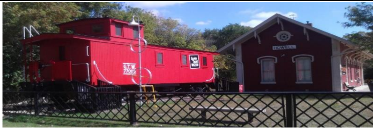
HAHS Caboose & Depot Museum Complex