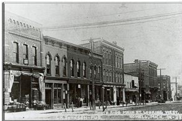
West Grand River Avenue in Howell, 1900

After statehood in 1837, Michigan assumed the costs for construction work to the Grand River Trail. At that time, about 60 miles had been surveyed from Detroit westward. The new state lacked the money to continue improvements to the road, and Michigan petitioned Congress for the better part of the next decade for money to complete the work. When the state capital was moved to Lansing in 1847, an improved road was needed to the capital city. The first segments of roadway were privatized starting in 1844. In 1850, the Michigan State Legislature established the Lansing and Howell Plank Road Company, which set about converting various Indian trails into the Lansing–Howell Plank Road, a task the company completed by 1853. At Howell the road connected with the Detroit–Howell Plank Road, establishing the first improved connection direct from the state capital to Michigan's largest metropolis. The Lansing–Detroit Plank Road was a toll road until the 1880s, and it eventually evolved into the eastern part of the modern Grand River Avenue.